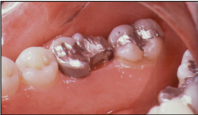
A tooth has broken below the gum line.

When a tooth is fractured or decayed below the gum line, this area must be uncovered before the tooth can be restored, for a number of reasons.