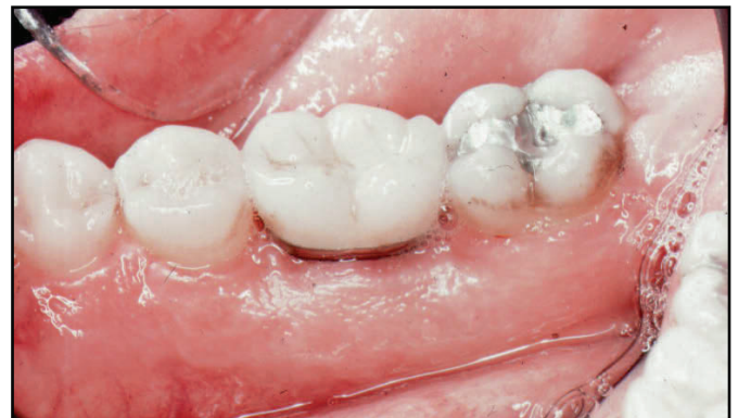
The tooth has been restored in a healthy manner.

After treatment, the fractured or decayed area is uncovered and accessible to the dentist for restoration, and the gum is healthy.